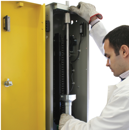
76-B4432, detail of lifting mechanism