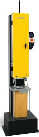
76-B4432 with mould