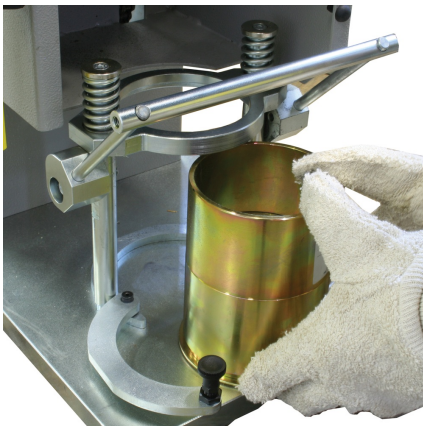
76-B4432, detail of clamping mechanism